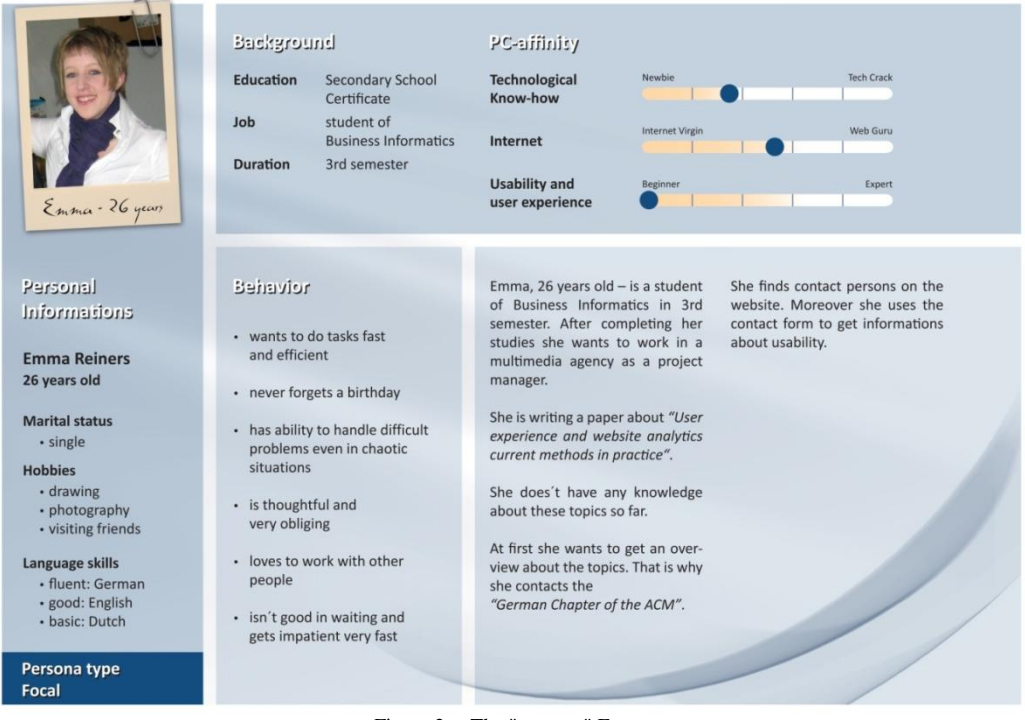
Figure 2. The "persona" Emma

It is possible to differentiate "personas" because there are two different ways to create them. On one hand there are real "personas", which are based on data gathered from interviews